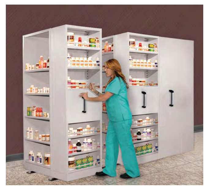
End-Stor<sup>TM</sup> for quick access applications such as pharmacies.