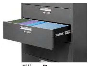
Filing Drawers (Shown with optional Electric Keypad Lock)