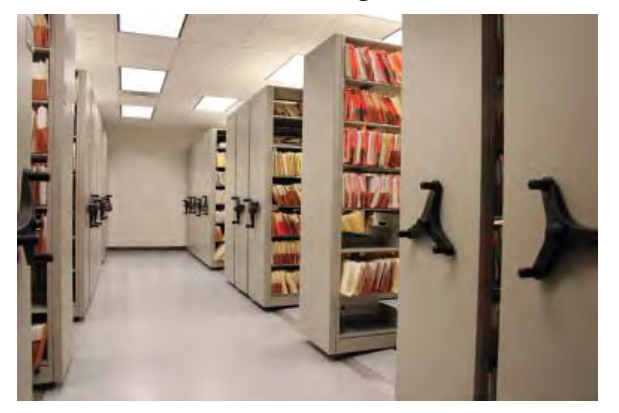
High Density Filing