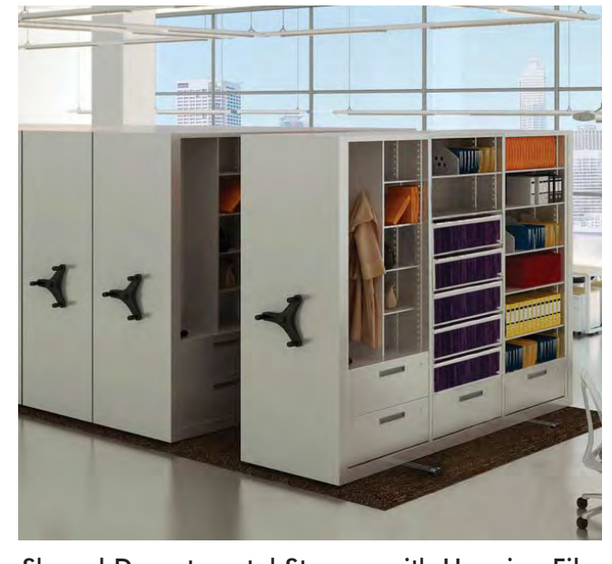
Shared Departmental Storage with Hanging Files